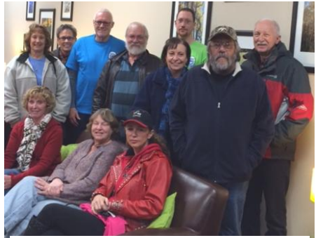
Those not smiling wanted some more!

Don't forget to add Frostbite Yogurt to your list of favorite stops for a treat.