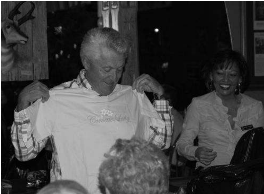
Lookin good, Nice pink Corvette Lady Tee shirt gift