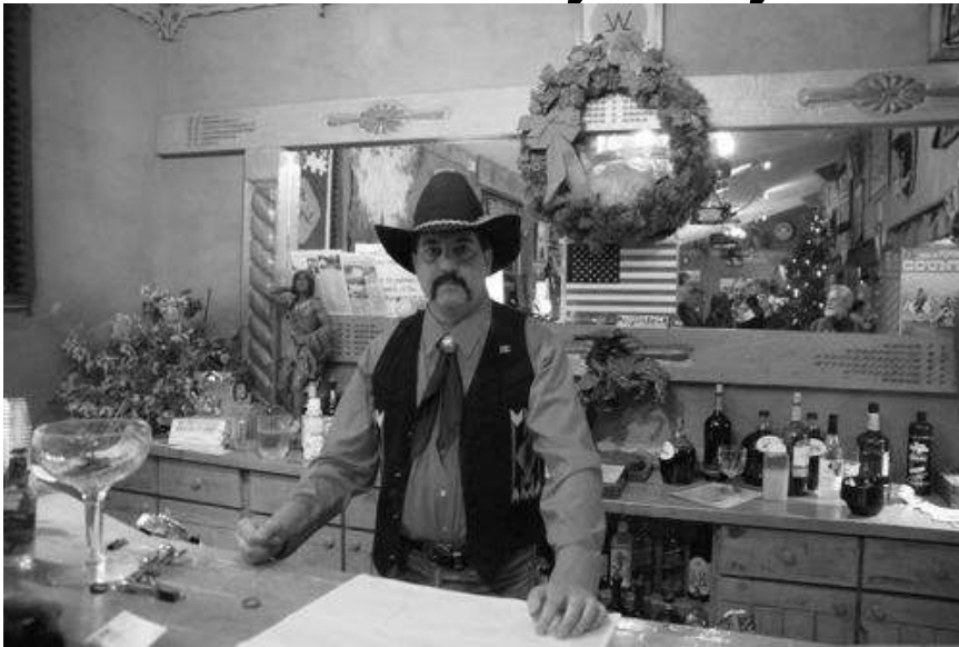
Don't mess with the bartender!!!!!!