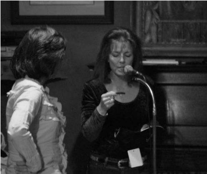
Looking for the lucky door prize winners