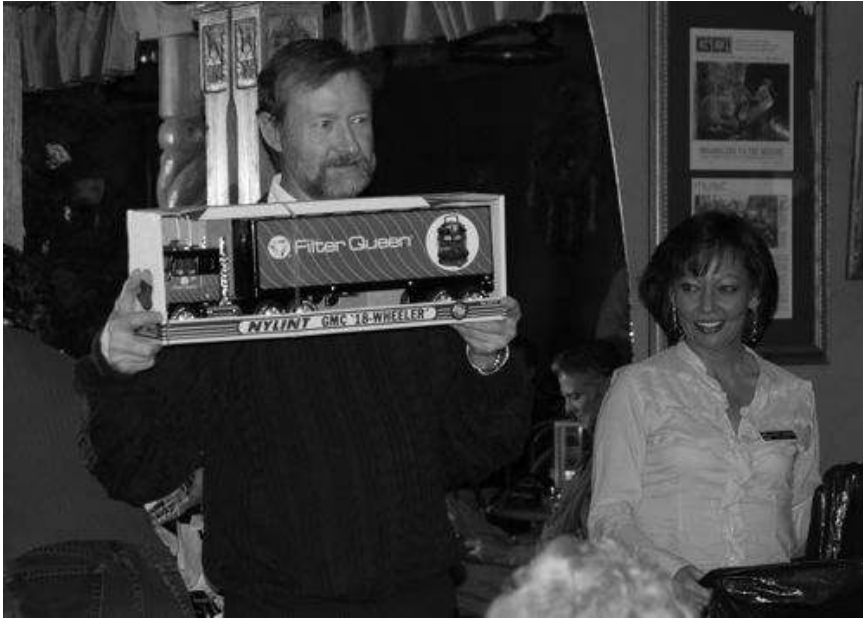
The much sought after "Filter Queen" model truck