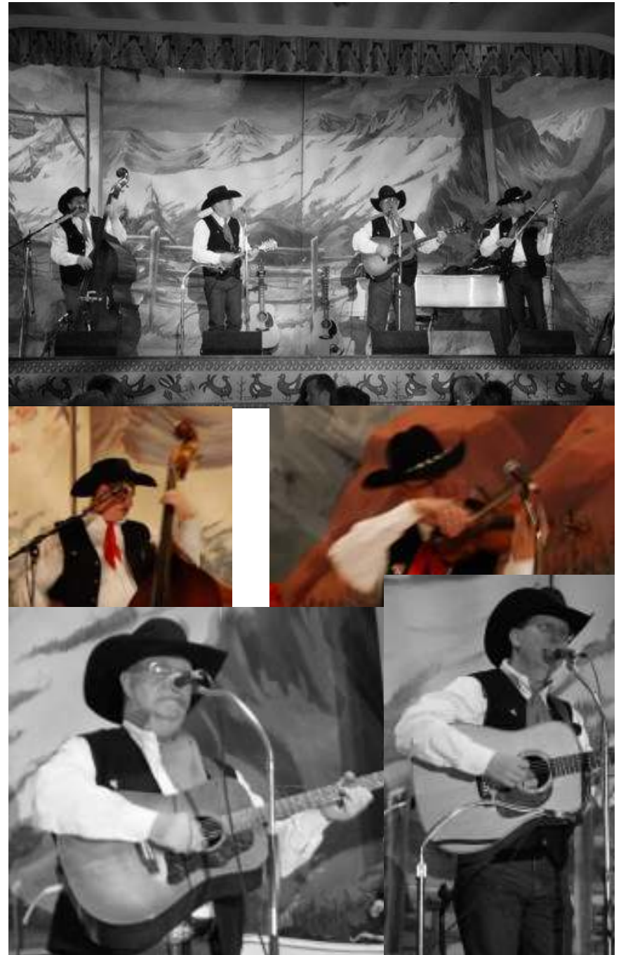
The Flying W Entertainers